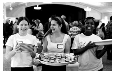
Scenes from Have a Heart 2020