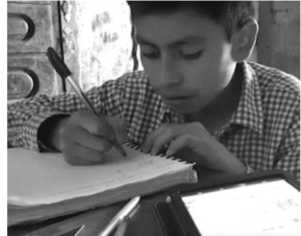
Epiphany's presence in a wounded world

The Service & Outreach Team invites you to the Church at 5:30 PM for a short video program followed by the beautiful Evensong service. Then join us in the Great Hall for a festive reception. No need to register or RSVP.